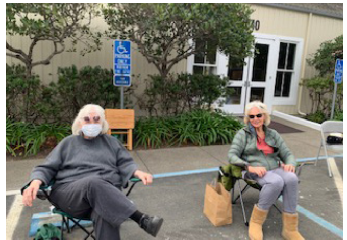
Images from our parking lot picnic last October.