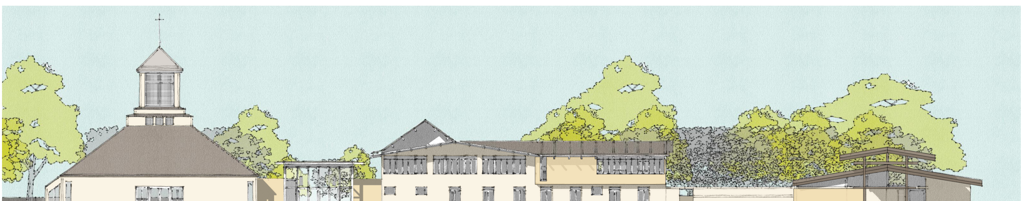
3 PROPOSED NORTH ELEVATION